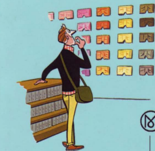
01 Bespoke briefs at Gunze's Omotesando emporium