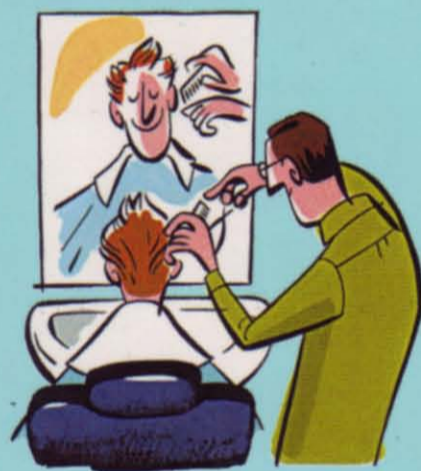
06 Man-scaping at Sky Salon in Yurakucho