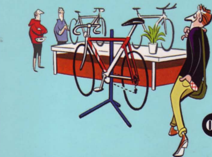
03 Competitive kit at Athlonia in Tokyo