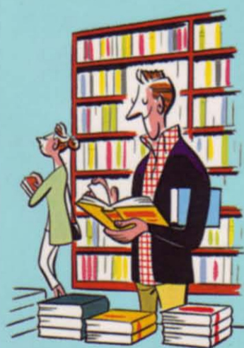
02 The ultimate browsing experience at 192 Books, New York